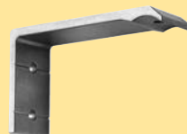
TOP MOUNT BRACKET