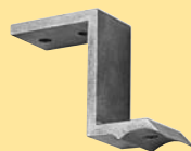
CEILING MOUNT BRACKET