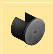
PLASTIC PLUG 1½"